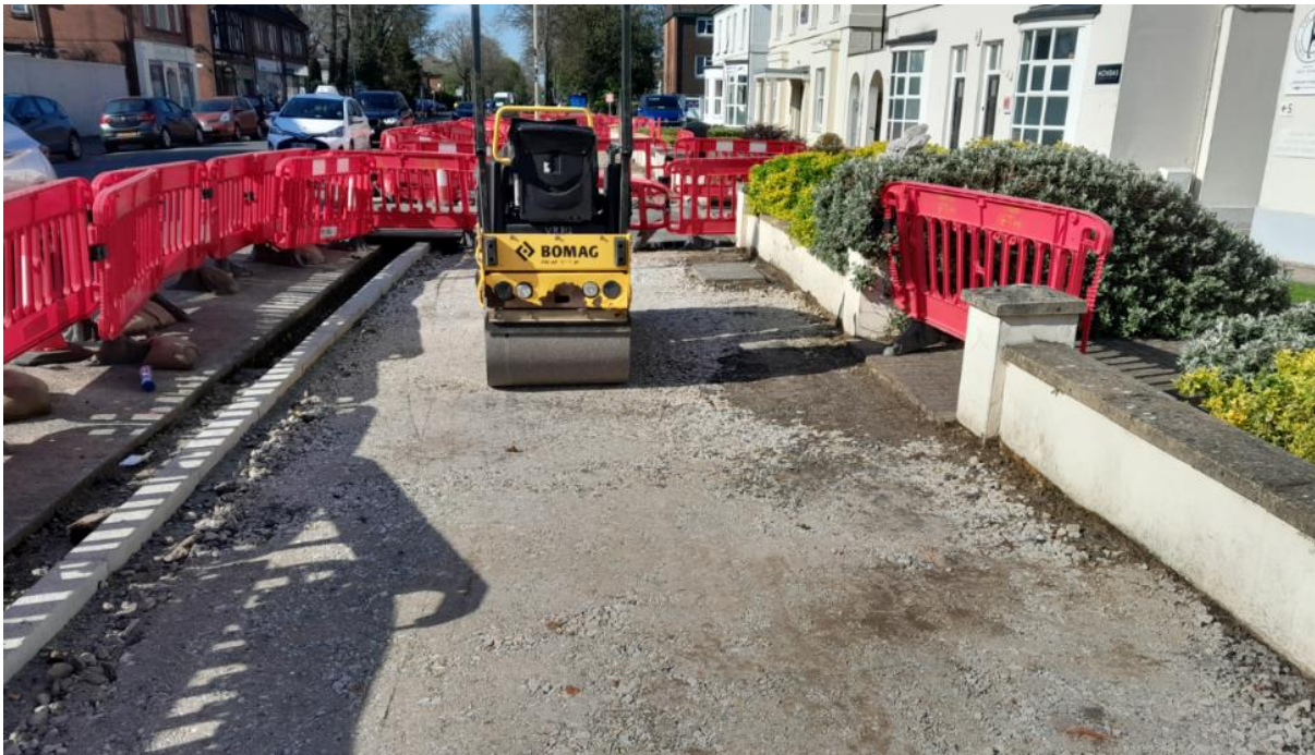
Alexandra Road – Pavement surfacing