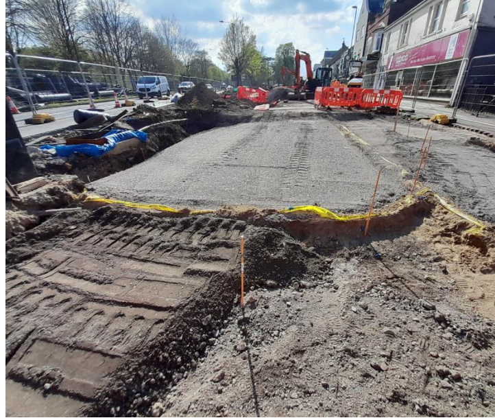
Lynchford Road – Breaking out the existing road