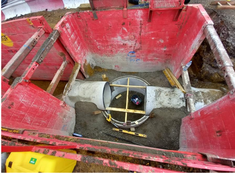
(Old) Lynchford Road – new drainage running adjacent to Morris Road