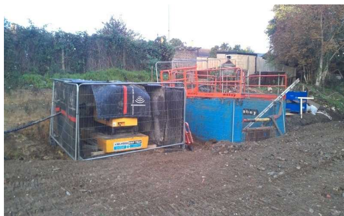
Temporary water pump