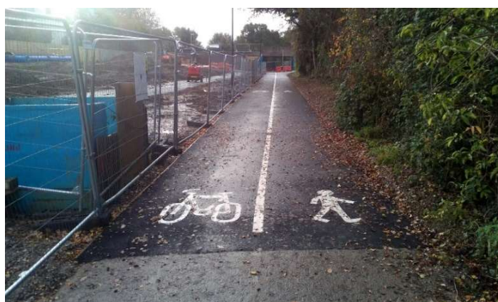
Henry Cort Way reopened