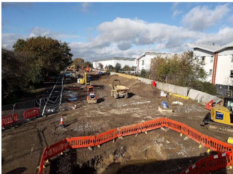
Site activity underway