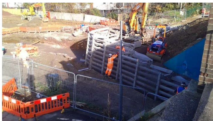
Works to the retaining walls at Rowner Road