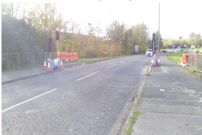
Rowner Road temporary Toucan crossing

The site will be staffed and monitored throughout the Christmas closure.