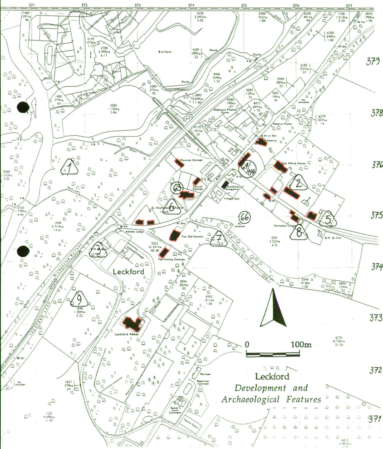
Leckford Development and Archaeological Features