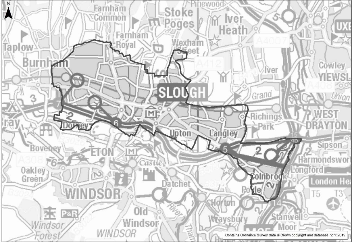
Figure 2 - Administrative area of Slough Borough Council