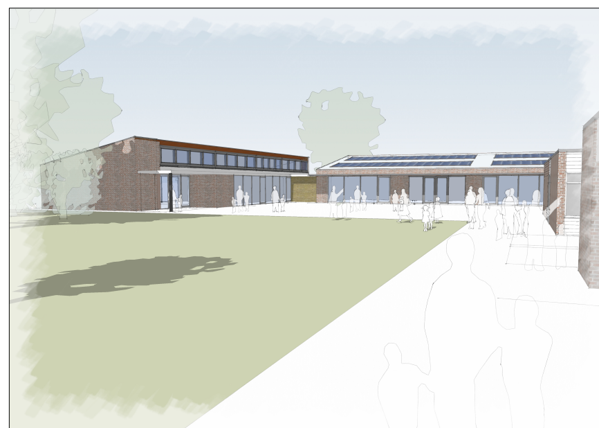
Proposed Perspective Across Courtyard