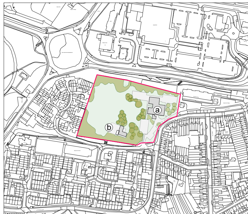
Existing Site Location Plan