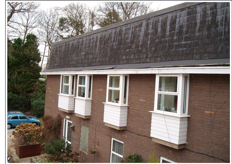
Photograph of Existing Roof