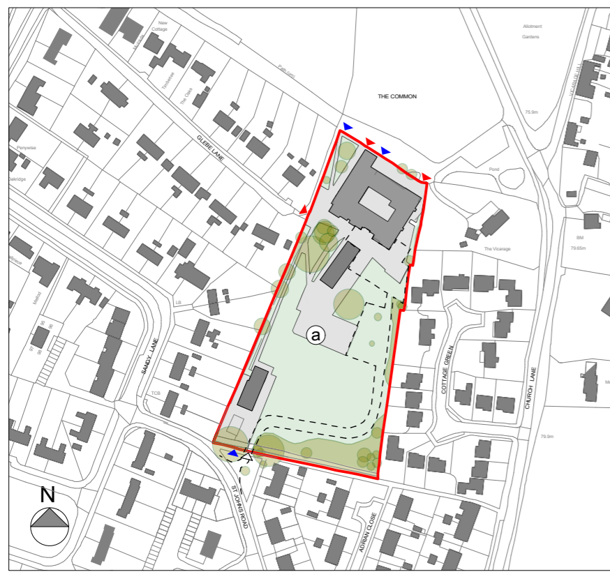
01 Existing Site Location Plan

P09894 A101- Oakwood Infants School March 2015