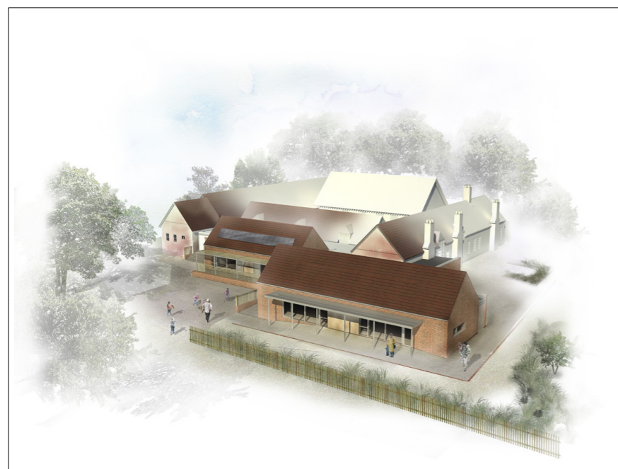
02 Perspective View of Proposed Extension from South