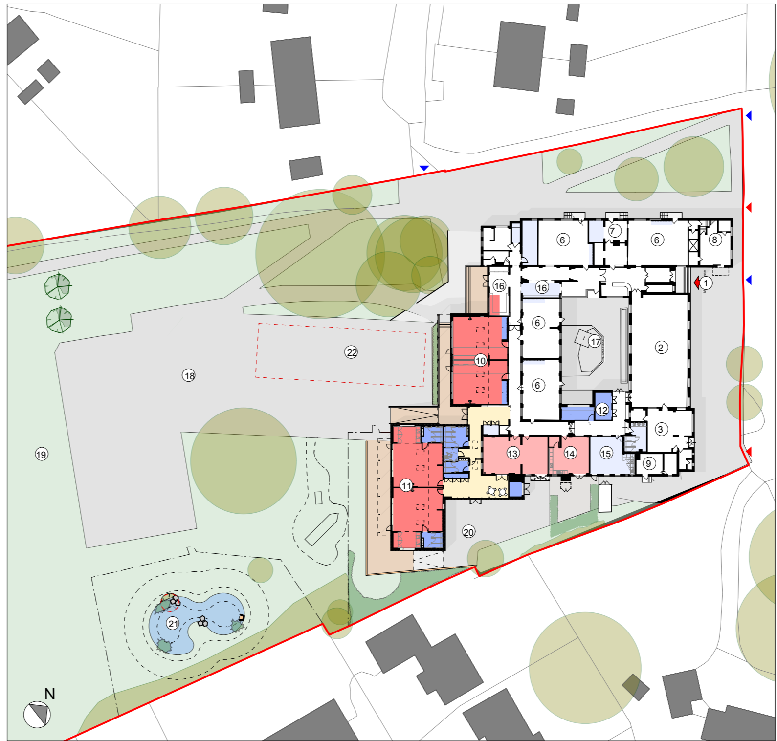
03 Proposed Site Plan