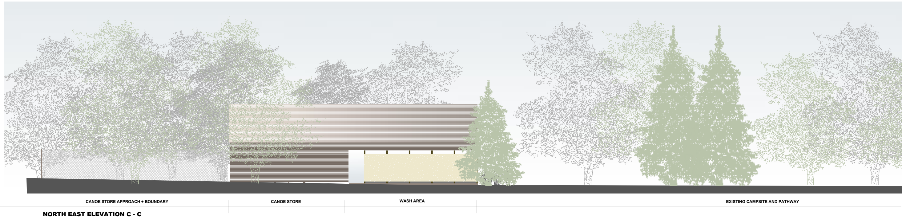
NORTH EAST ELEVATION C - C