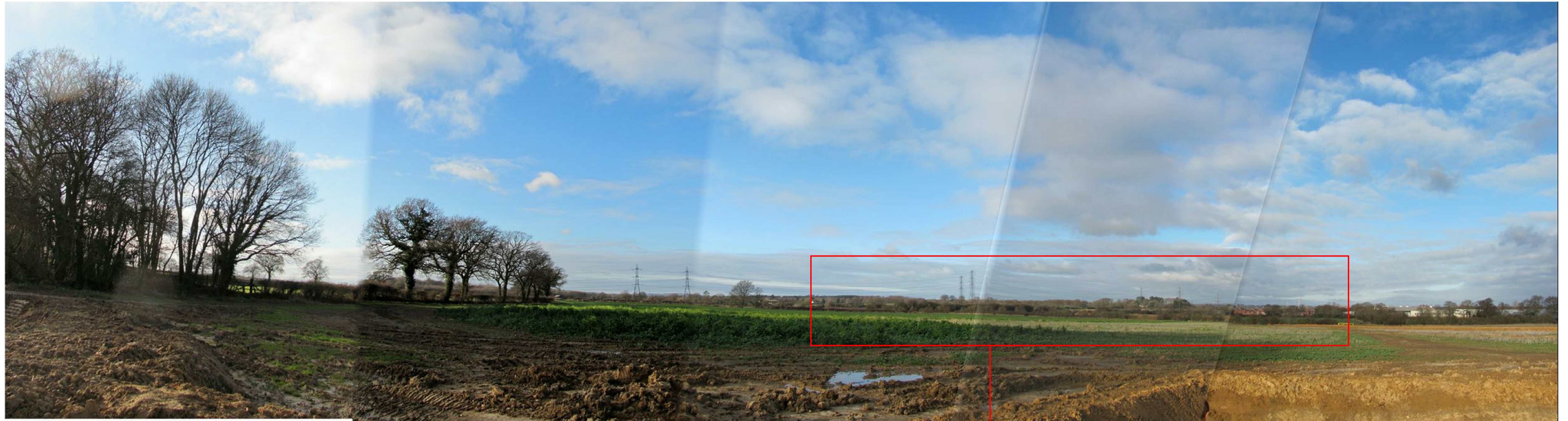
Panorama looking west and north