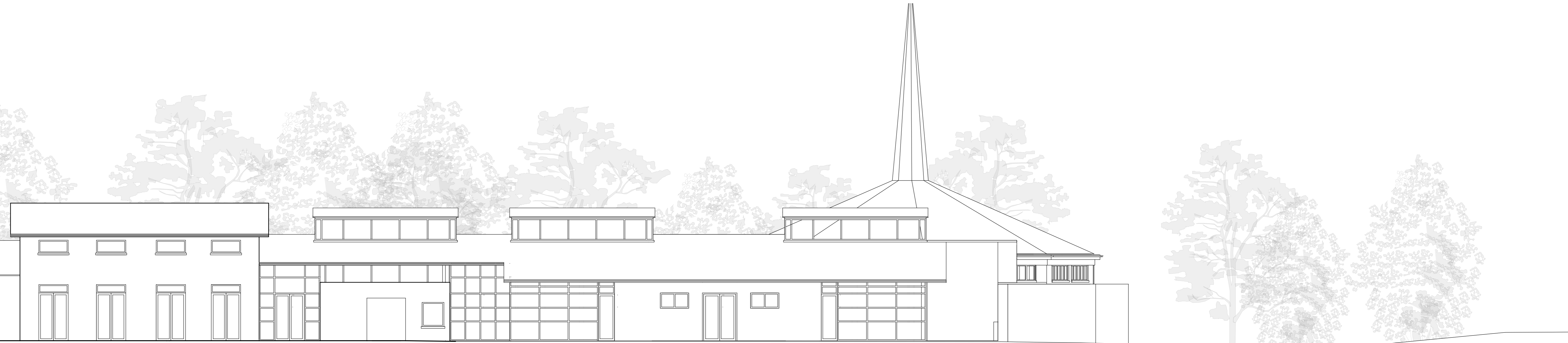
Elevation 2 - Existing condition