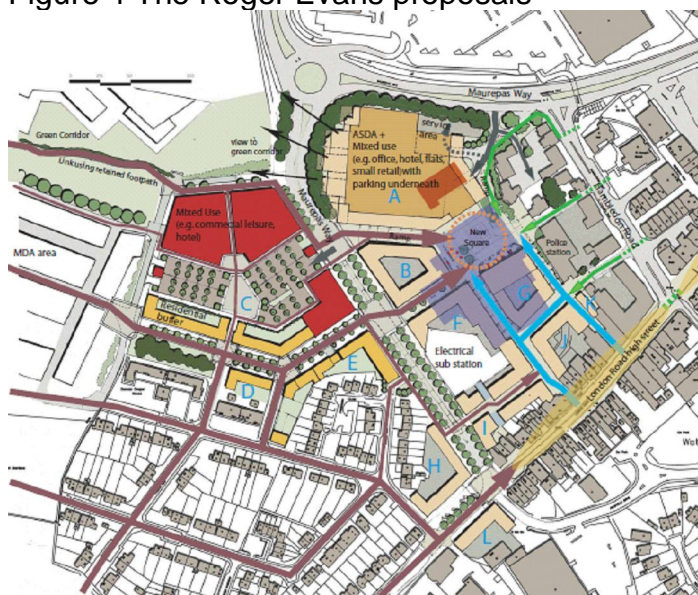
Figure 4 The Roger Evans proposals

The report suggests a ‘Manual for Streets’ approach to Maurepas Way, with carriageway space apportioned to provide single carriageway running in both directions, with space for on-street parking either side and a central overrun area. The report also proposes two working options for the ASDA site, with the store either remaining in its existing position, or relocating to the north of the site where the main surface car park is currently located. Figure 4 illustrates this scheme.