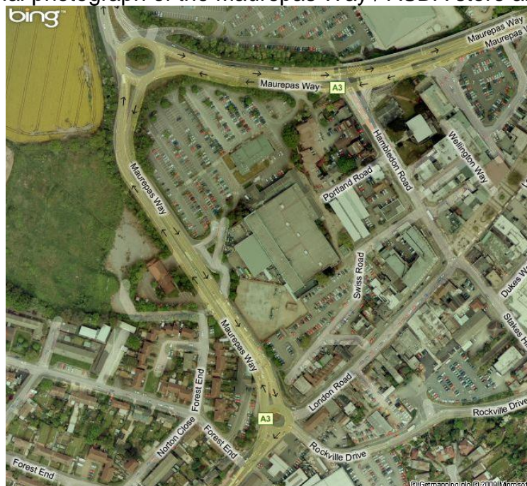
Figure 2 Aerial photograph of the Maurepas Way / ASDA store area

On the eastern side of Maurepas Way, an ASDA supermarket store and large surface car park with access slip roads directly on and off Maurepas Way creates a further barrier to walking and cycling between the MDA and town centre. This site, together with Maurepas Way, represent the greatest challenge to achieving high quality linkages between the MDA and town centre in this location. The level difference across the site also presents a further barrier to accessibility. Figure 2 is an aerial photograph of this area with some key features being annotated.