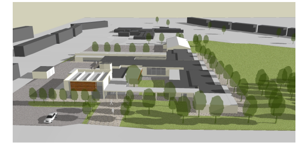
Birds Eye View of Entrance