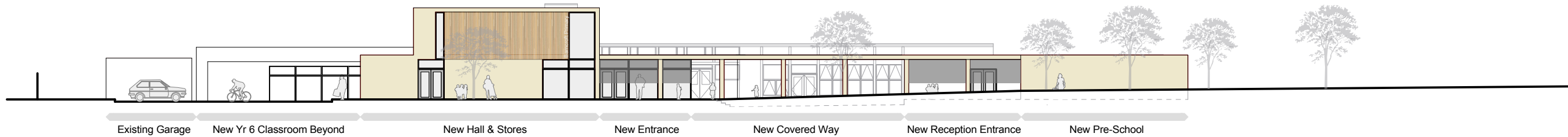
West Elevation 1:150 @ A1