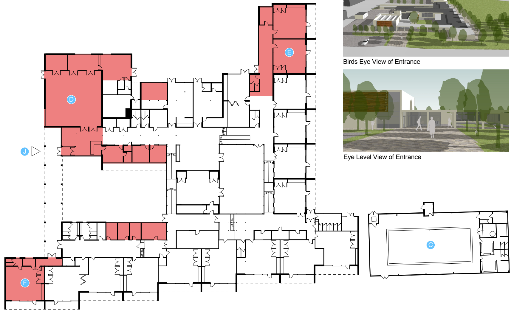
Floor Plan 1:250 @ A1