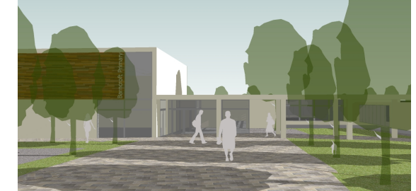
Eye Level View of Entrance