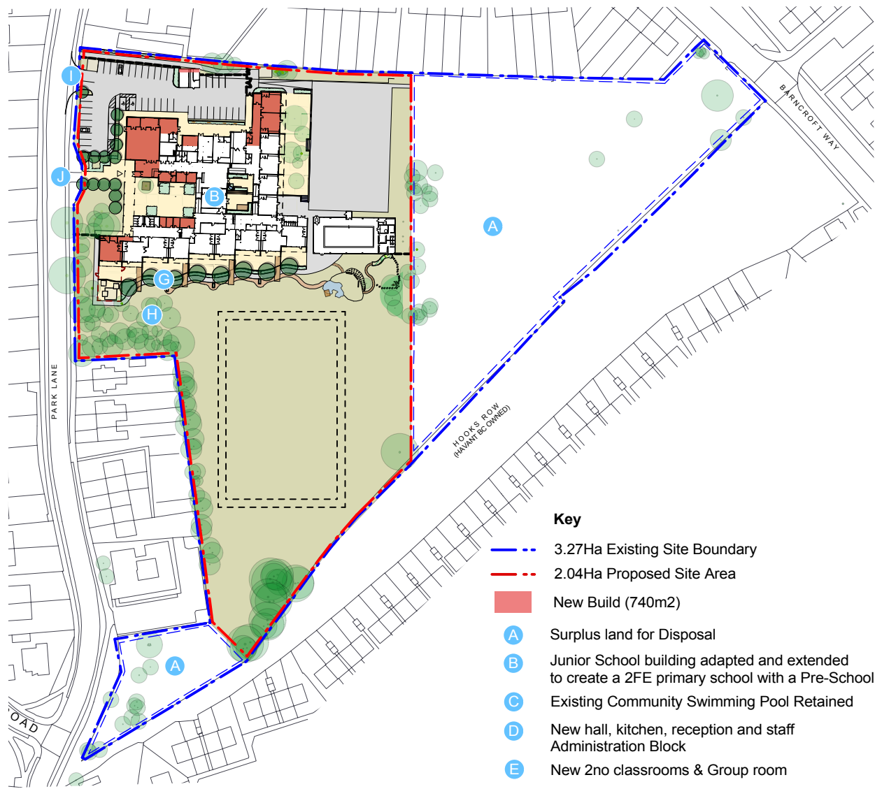
Location Plan 1:2000 @ A1