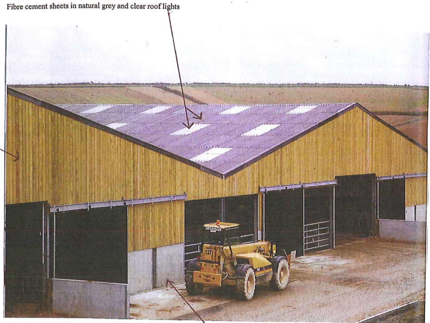
Fibre cement sheets in natural grey and clear roof lights