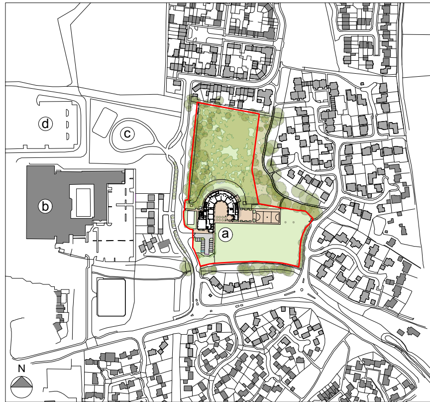
Existing Site Location Plan