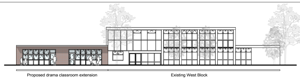
Proposed Eastern Elevation - West Block