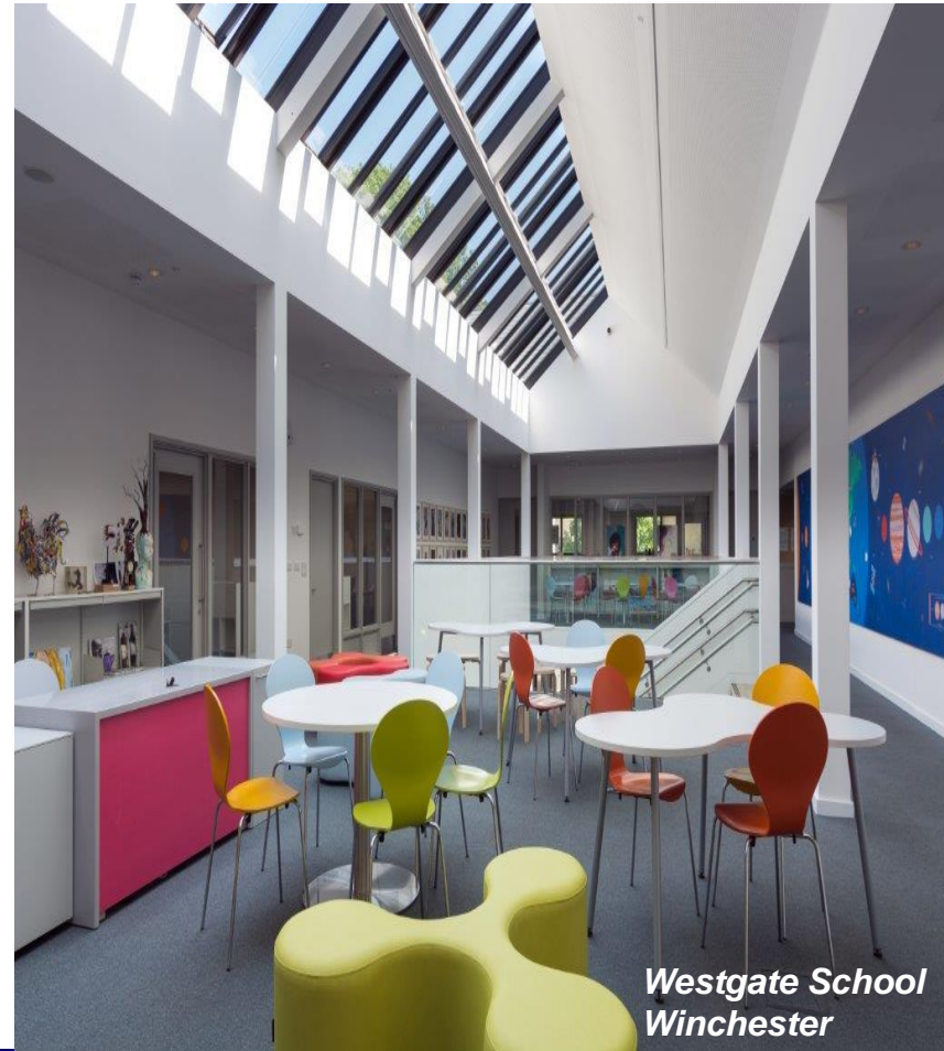
Westgate School Winchester