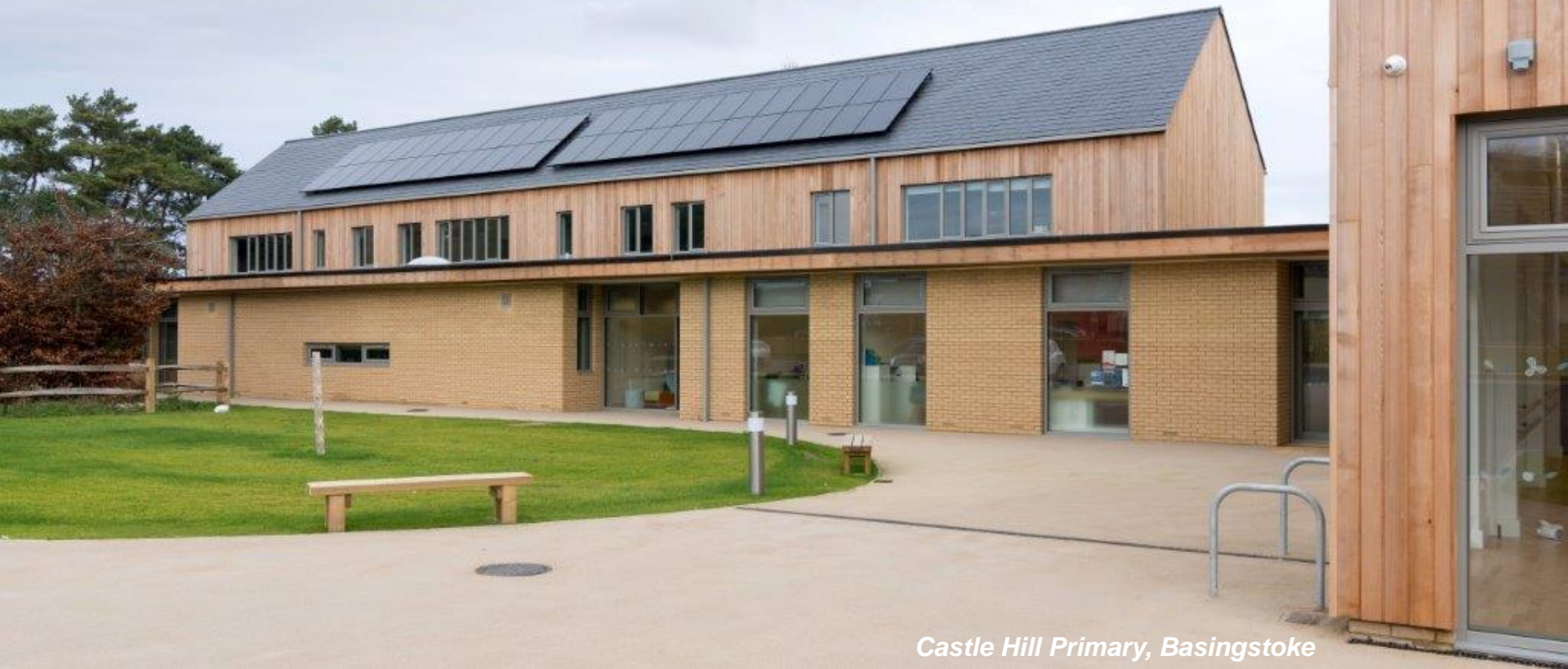
Castle Hill Primary, Basingstoke

That the Children and Young People Select Committee support the recommendations being proposed to the Executive Lead Member for Children's Services in section 18 (page 20) of the report.