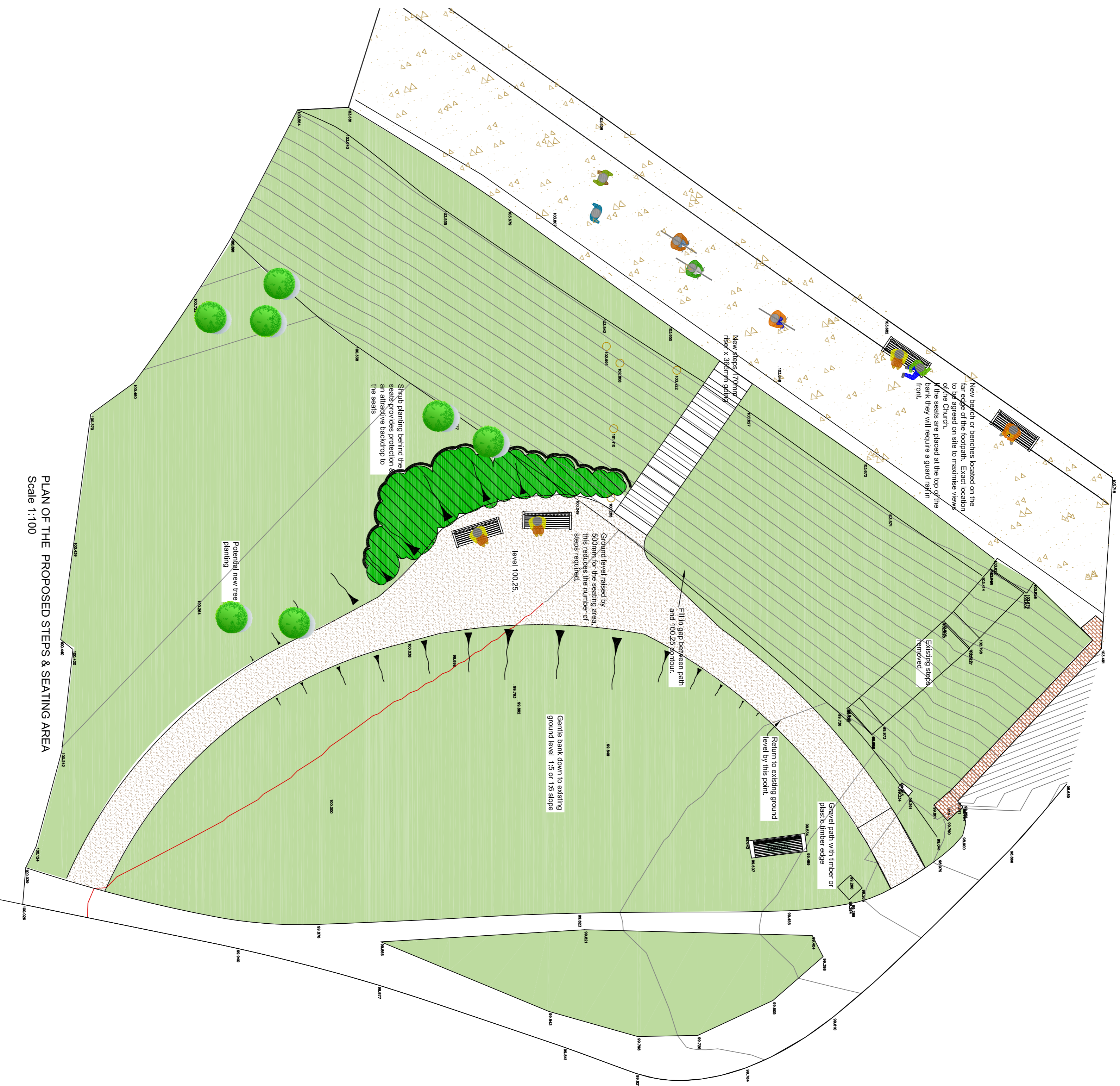
PLAN OF THE PROPOSED STEPS & SEATING AREA Scale 1:100