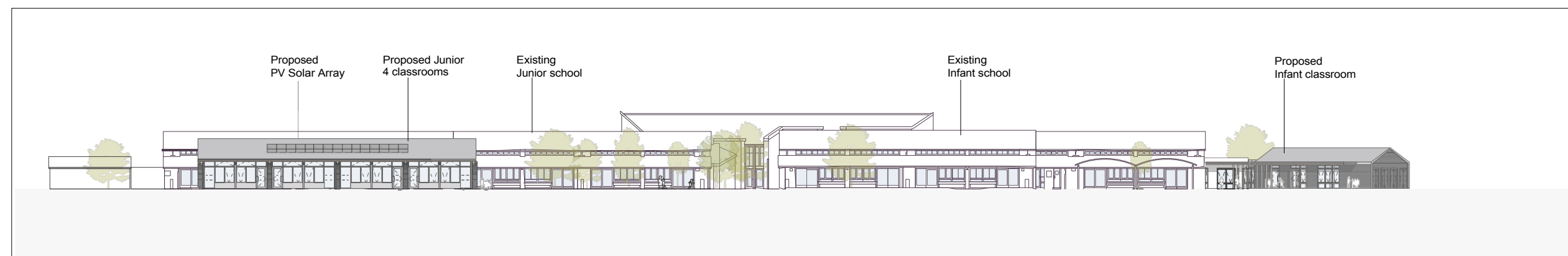
Proposed South Elevation - Infant and Junior School