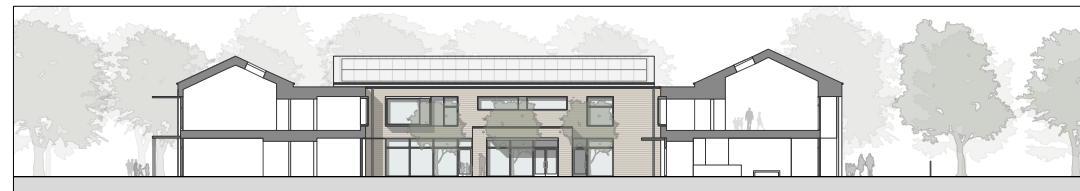
Classrooms & Group Rooms Courtyard LRC & Classrooms