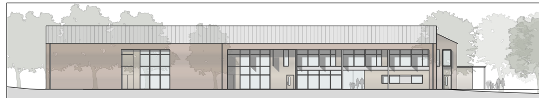
Kitchen, Hall & Studio LRC & Main Entrance Admin