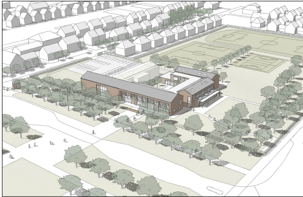
Proposed Primary School looking South West