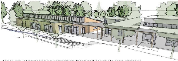
Aerial view of proposed new classroom block and canopy to main entrance