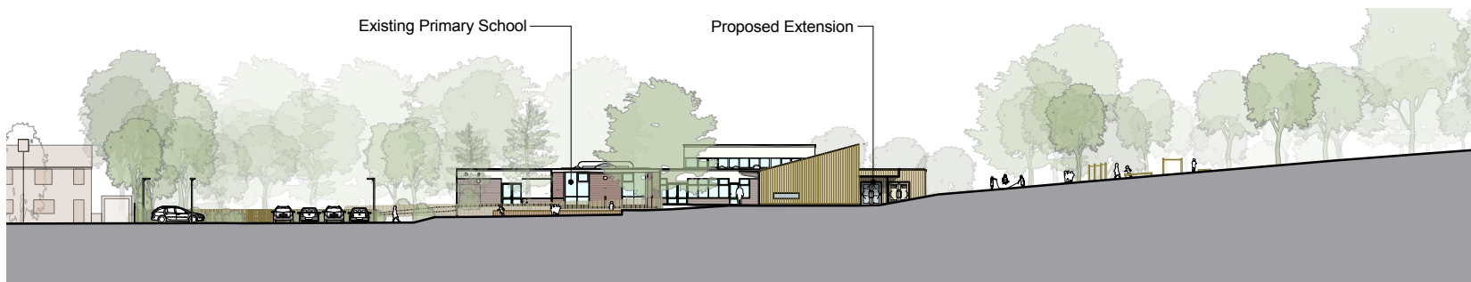
Section AA - Proposed East Elevation