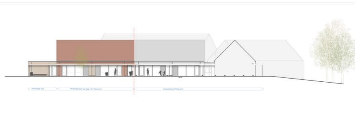
Proposed South East Elevation