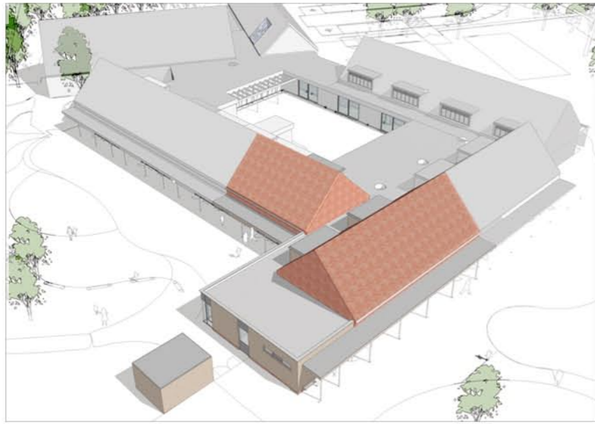
Proposed Aerial View Looking North