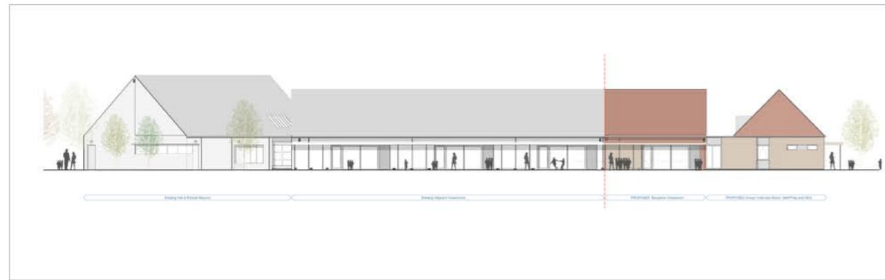
Proposed South West Elevation