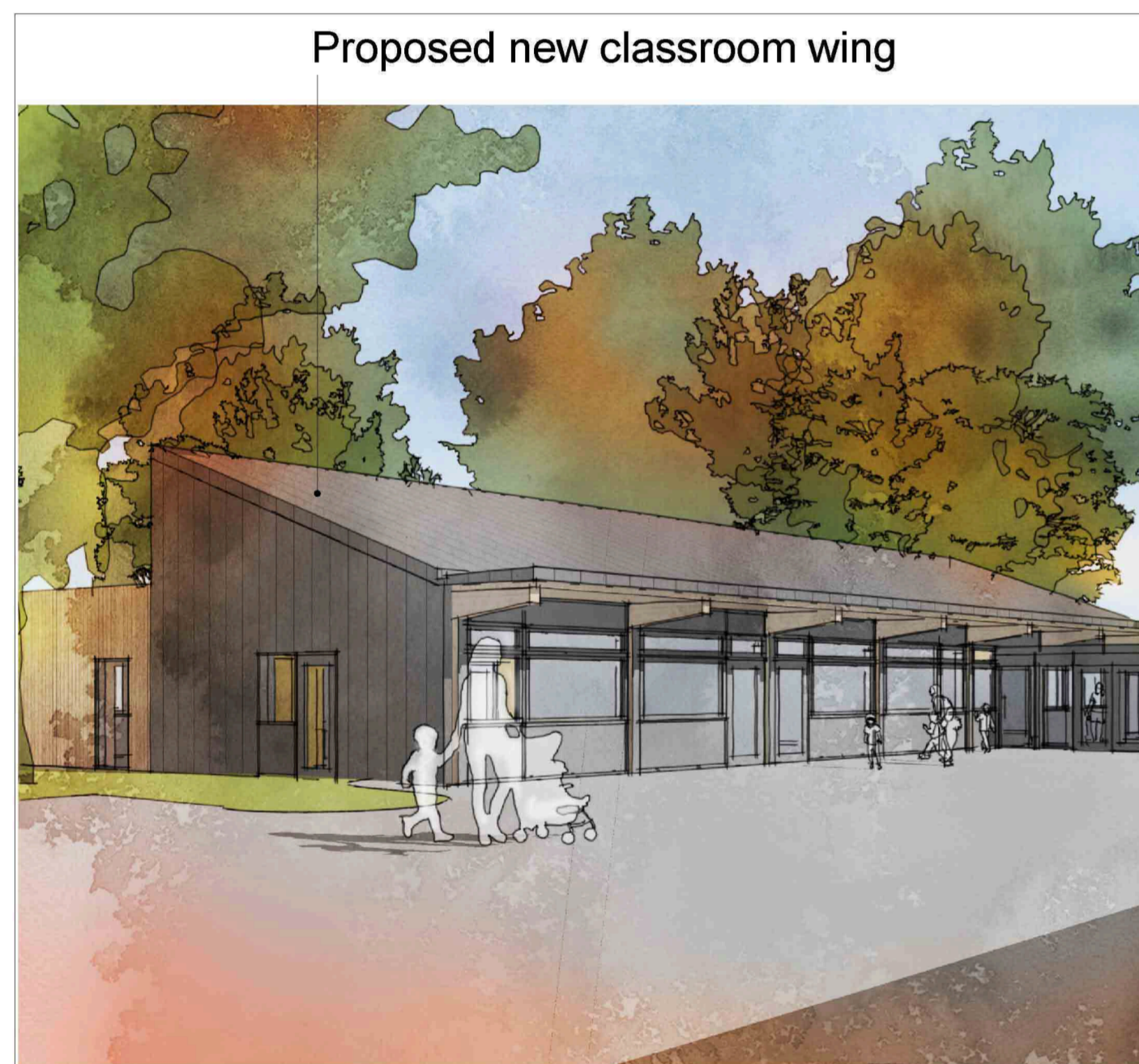
02 Aerial View Looking North