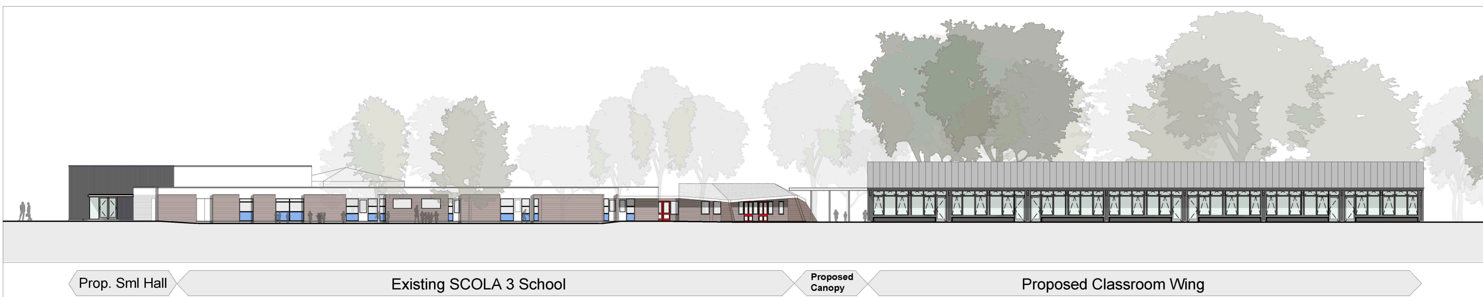
04 Proposed South Elevation