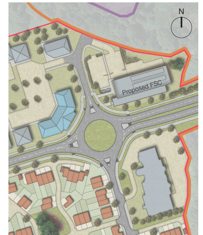
PROPOSED MASTERPLAN OVERLAY