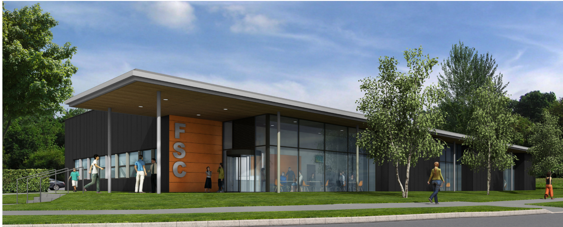
PERPECTIVE VIEW OF MAIN ENTRANCE FROM RELIEF ROAD