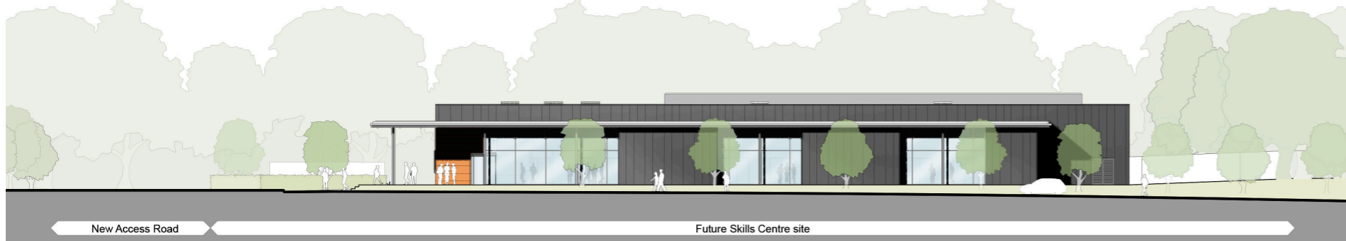
PROPOSED ROAD ELEVATION