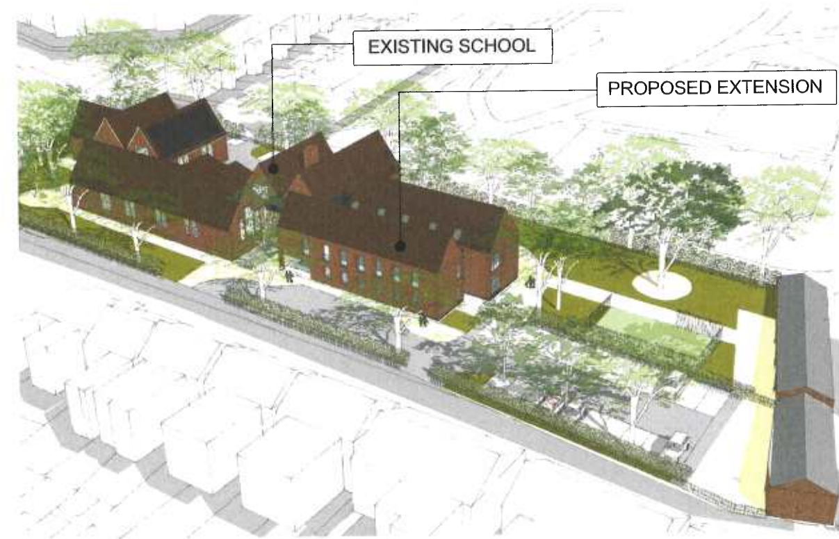
PROPOSED AERIAL VIEW FROM SOUTH WEST