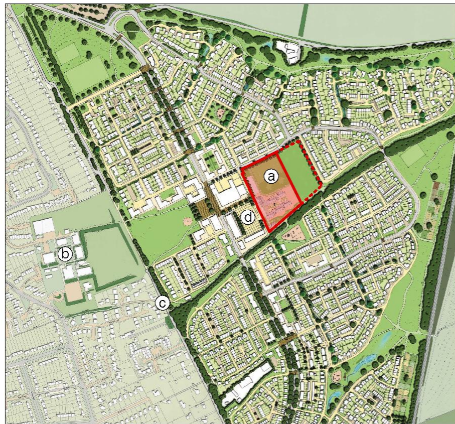
Existing Site Location Plan

Layout around site indicative only - based on latest development master plan.