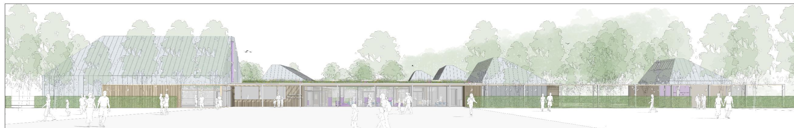
Proposed West Elevation - View from 'The Place'

© Crown Copyright and database rights 2015. All rights reserved. HCC 100019180.