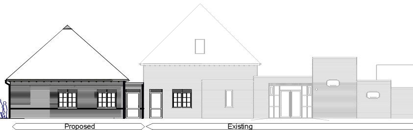
Proposed Existing Proposed South Elevation @ 1:200