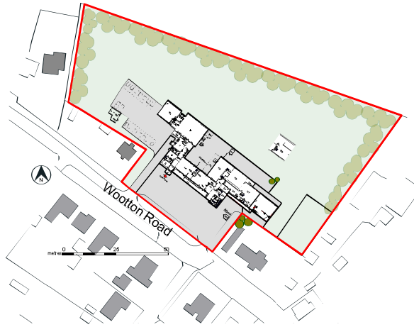
Proposed Site Location Plan