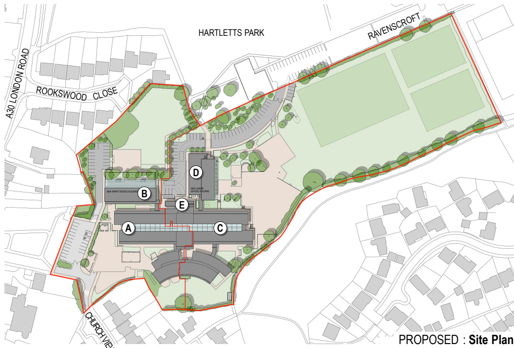
PROPOSED : Site Plan