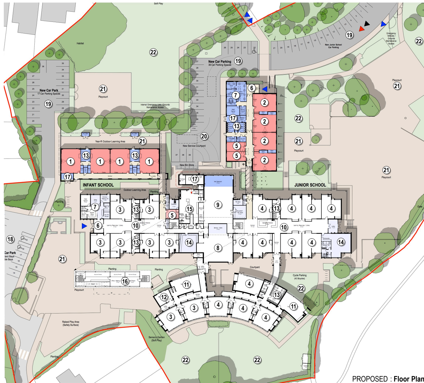
PROPOSED : Floor Plan