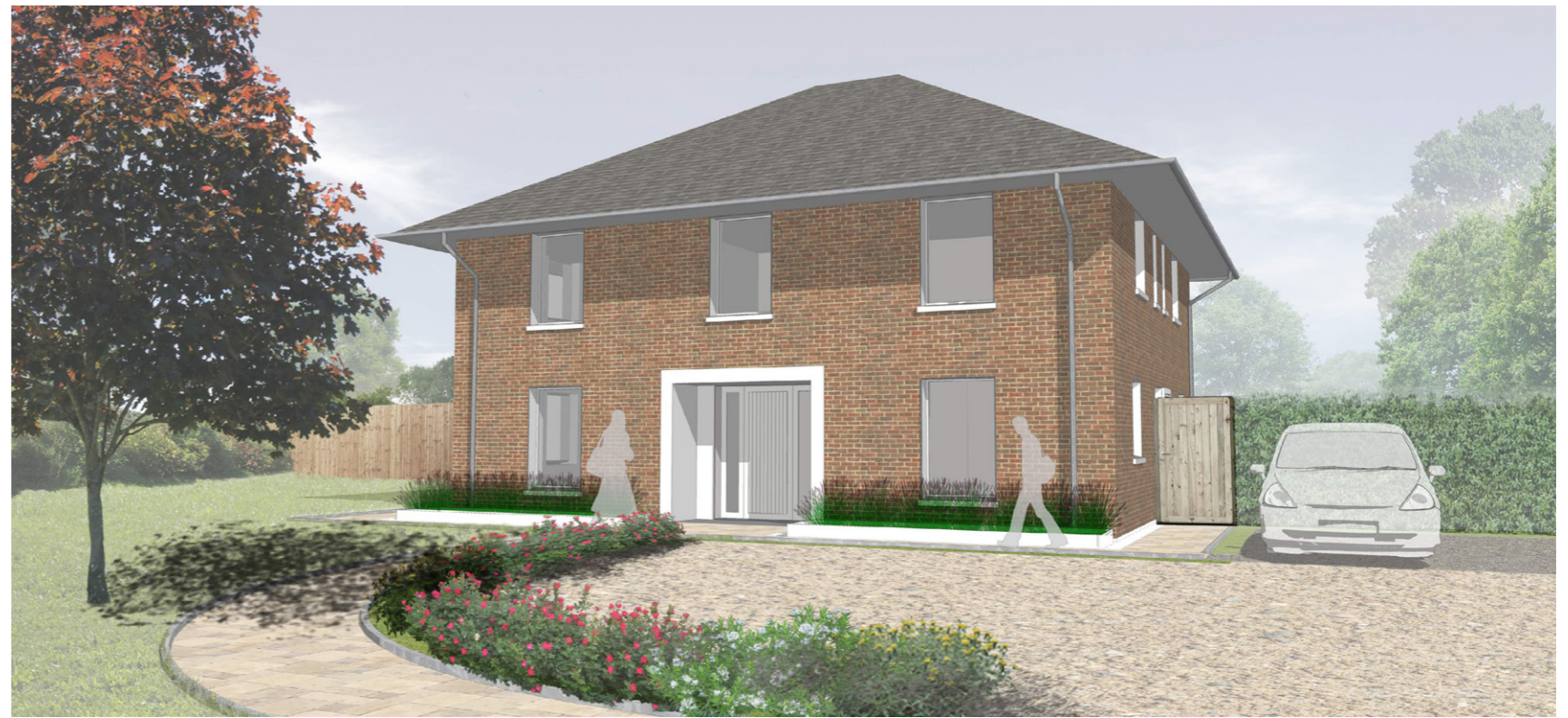
FRONT VIEW OF GENERIC DESIGN