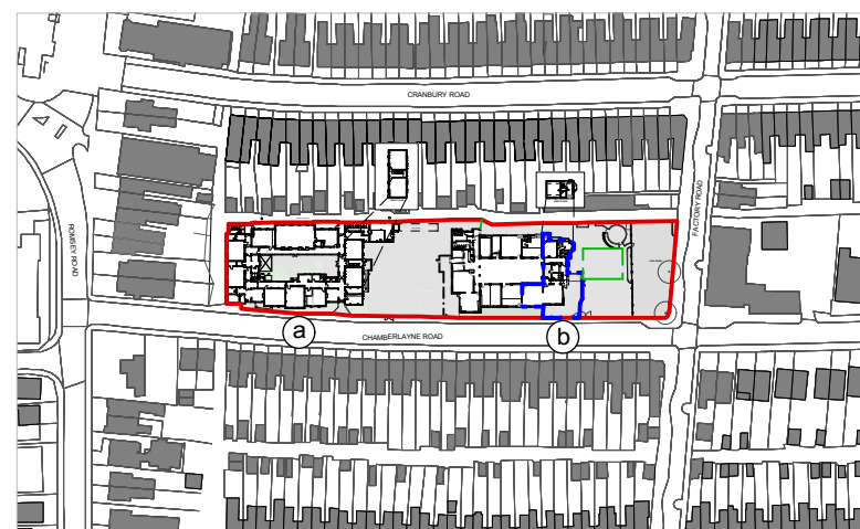
Existing Site Location Plan