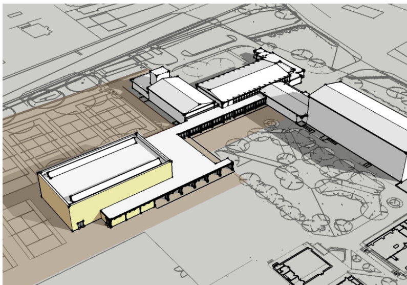
Proposed Perspective Aerial View