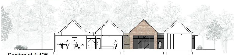
Section at 1:125