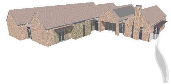
View of Proposed Building from the South West