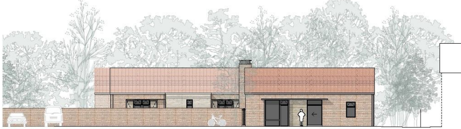
East (Entrance) Elevation at 1:125