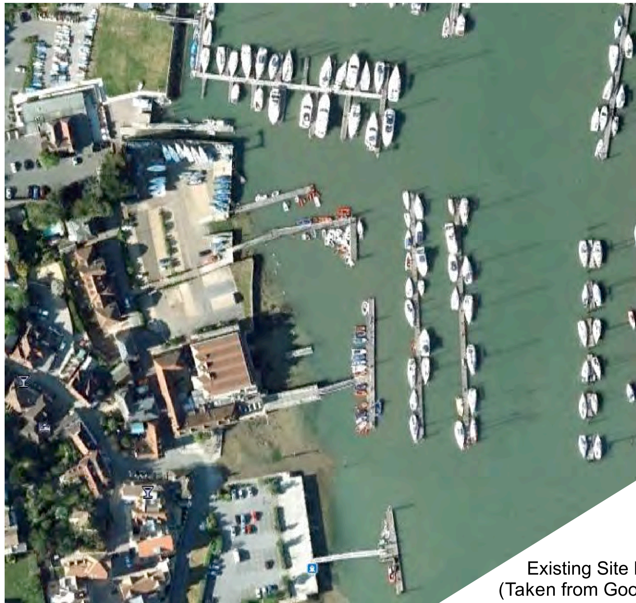
Existing Site Layout (Taken from Google Earth)