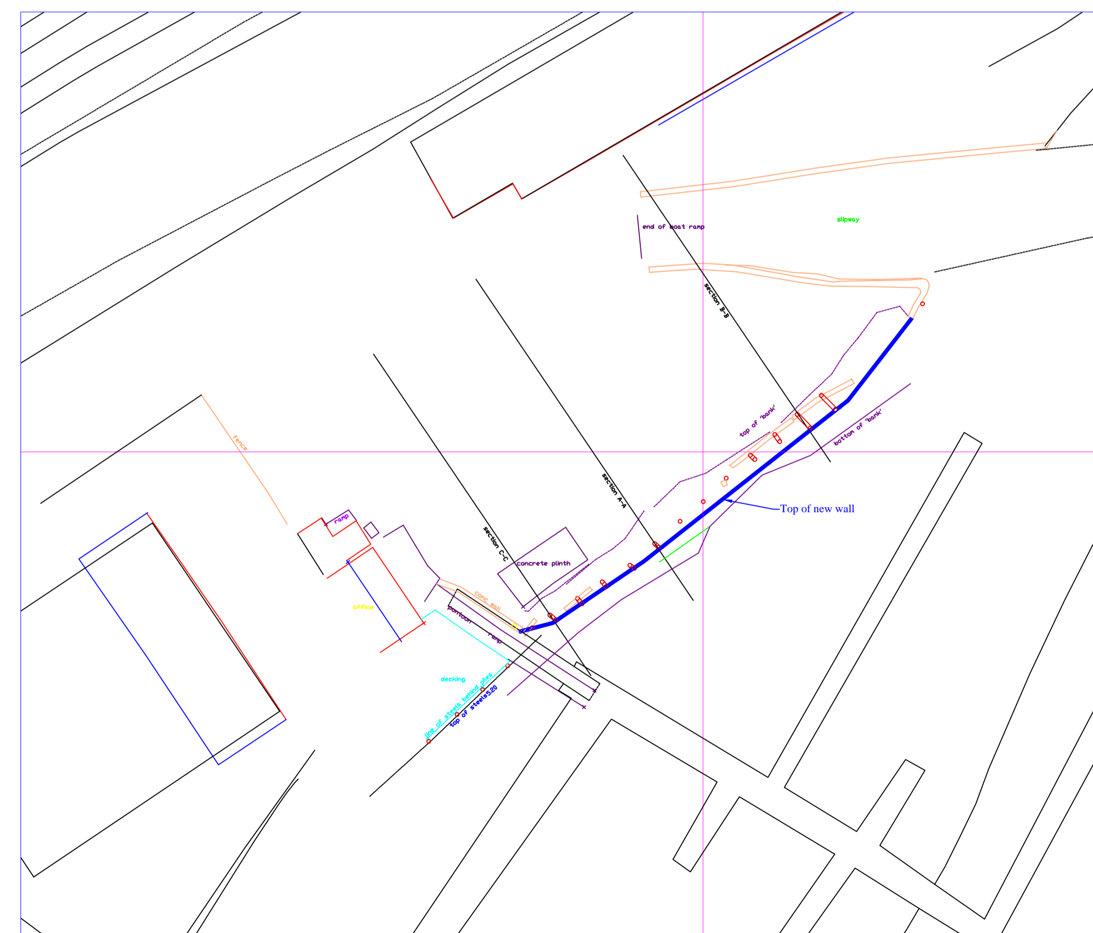
PLAN SHOWING PROPOSED WALL