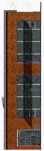
3 Proposed South East Elevation - Proposed & Existing Classrooms 1:100 @ A1