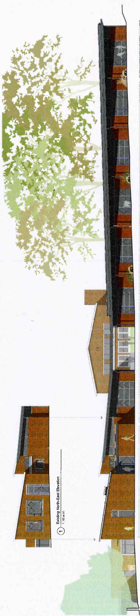
2 Proposed North East Elevation - Classrooms 1:100 @ A1

Plan Colours Key existing building proposed building internal alterations external works