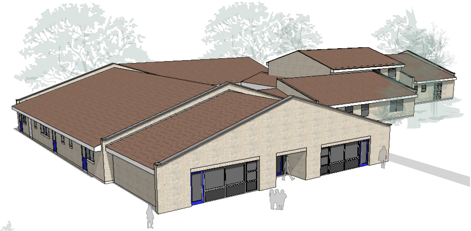
4 Proposed View from South West