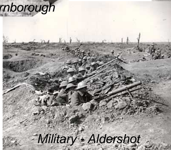
Military - Aldershot