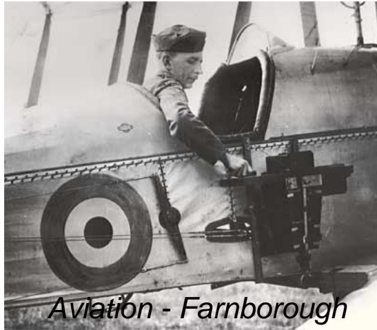
Aviation - Farnborough