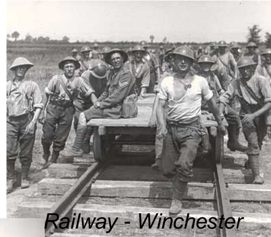
Railway - Winchester