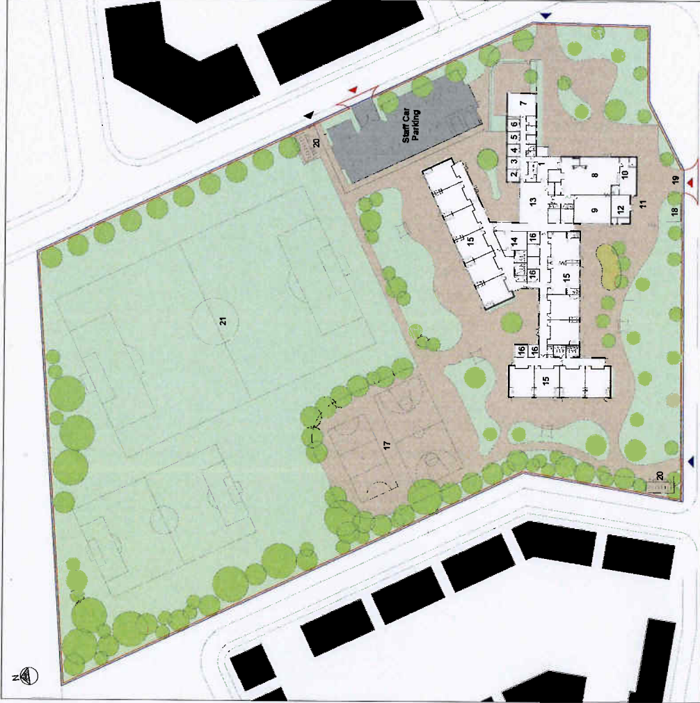
Site Location Plan 1:1000