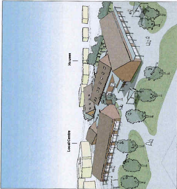
Perspective Sketch of Proposed Primary School Looking South East