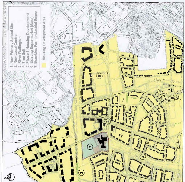
Site Location Plan 1:1000