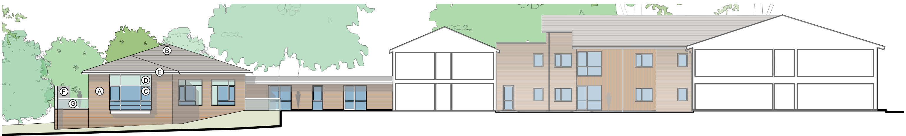
PROPOSED NORTHEAST ELEVATION 1:200