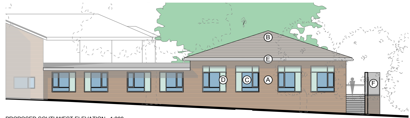
PROPOSED SOUTHWEST ELEVATION 1:200