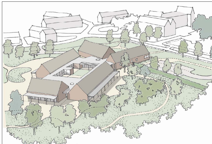
Perspective Sketch of Proposed Infant School