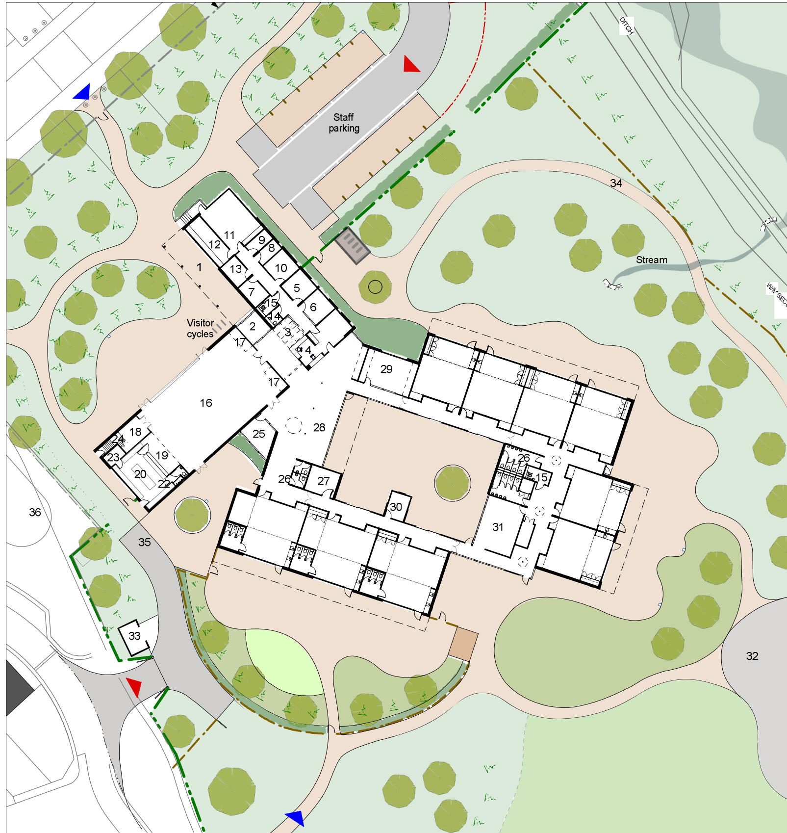
Site Location Plan 1:500