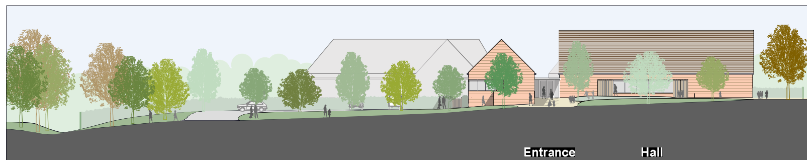
North Elevation 1:500