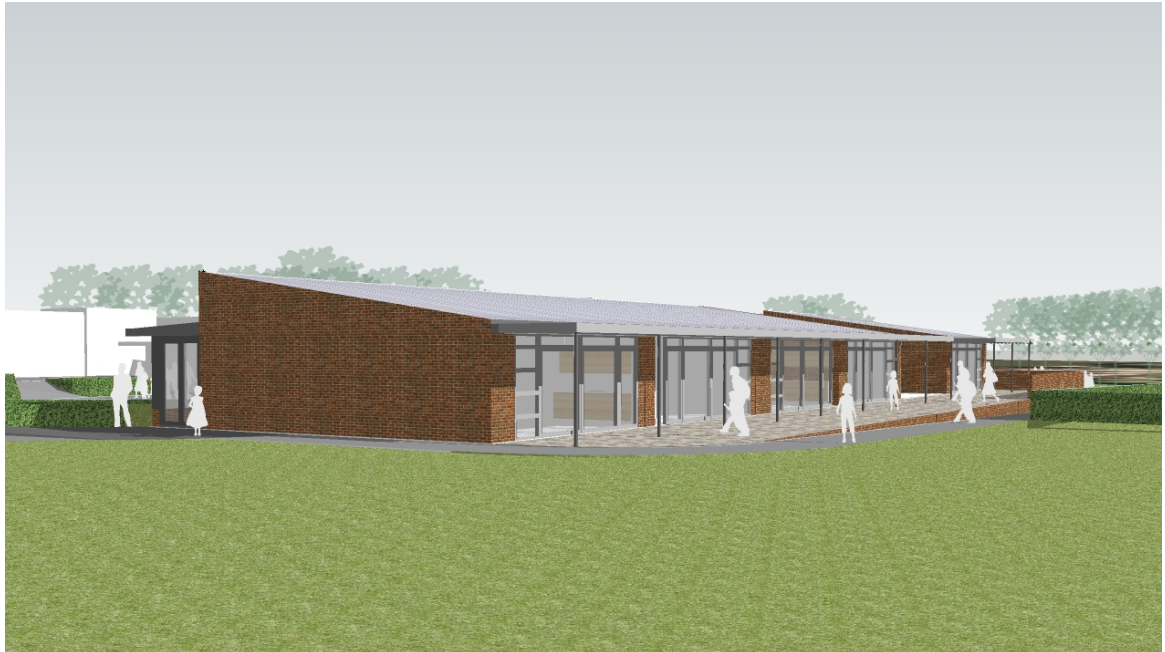
Image of Proposed 5 Classroom extension looking East