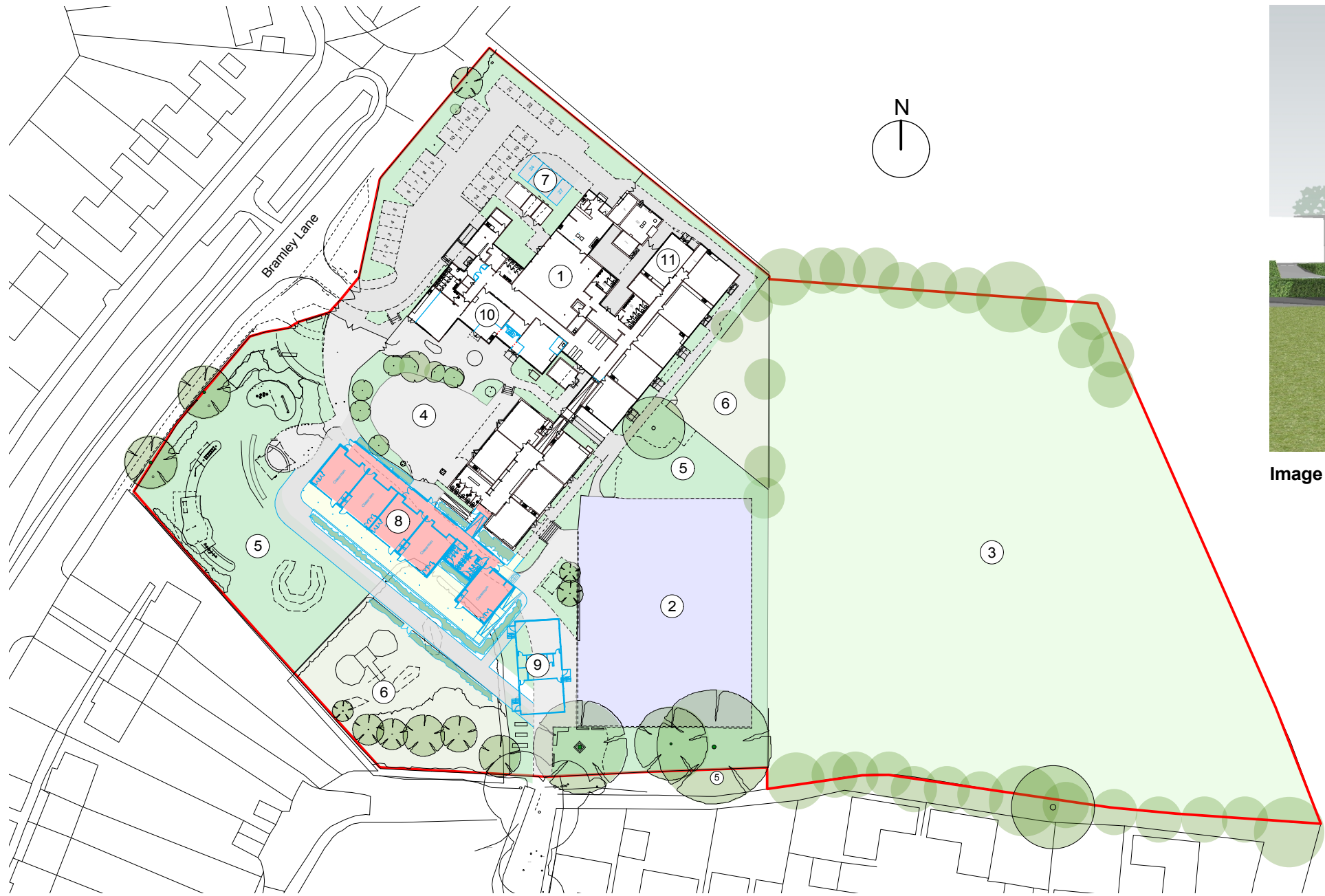
Proposed Site Plan 1:1000@A3