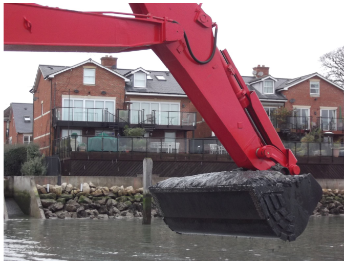
Above & below: Dredging at Port Hamble Marina