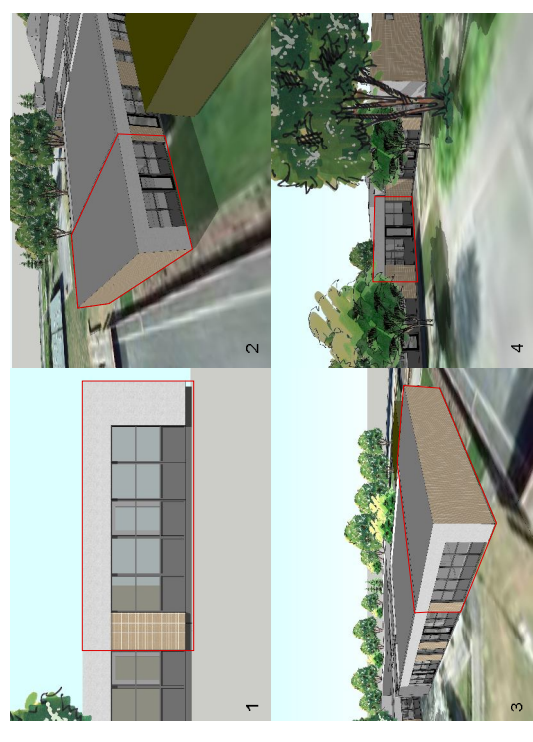
3 Proposed New Extensions Views 1. Proposed new classroom extension elevation. 2. Perspective view. 3. Perspective view. 4. Proposed new classroom infill perspective view. Materials to match proposed re-clad of brick and render.