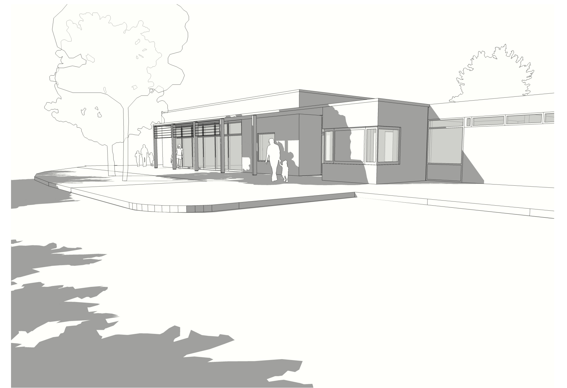
3 Perspective Views