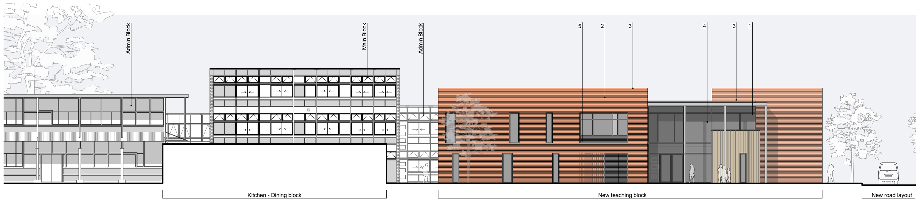
2. Proposed North Elevation