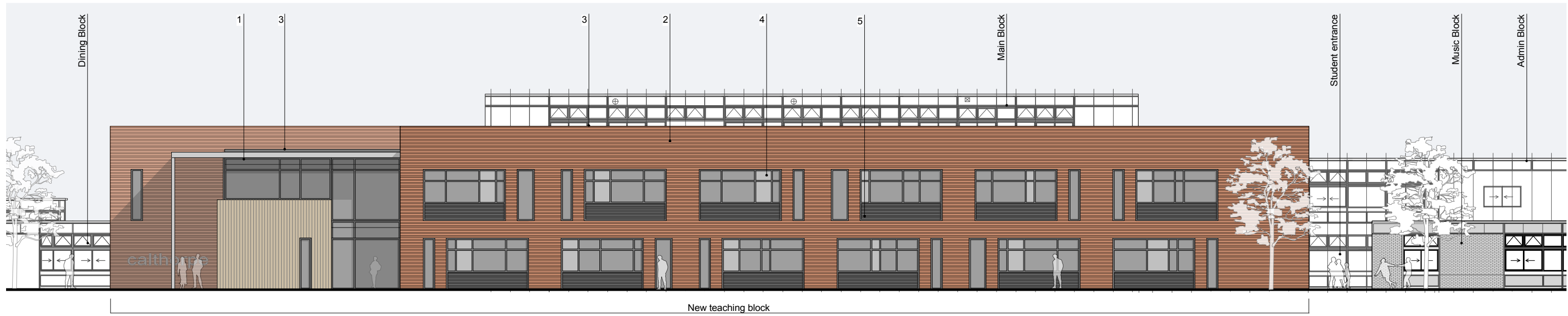
1. Proposed West Elevation