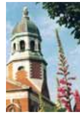
Royal Victoria Country Park

Public Transport: Hill Head First, 33, 35 - 023 9286 2412