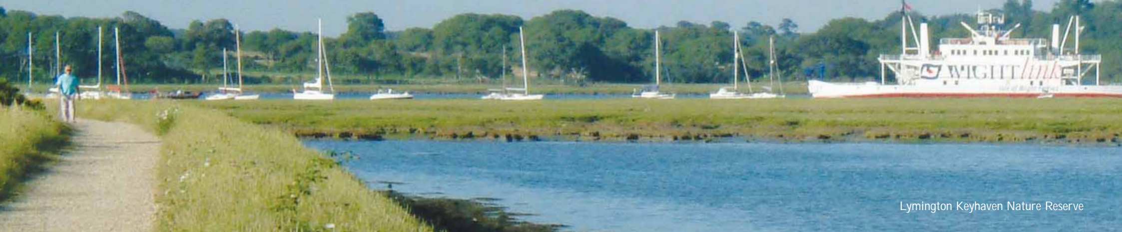
Lymington Keyhaven Nature Reserve

At the end of the path is Emsworth, a picturesque fishing village set at the top of Chichester Harbour. Once famous for its oysters, it is also remembered as home of PG Wodehouse whose fictional characters took on many local place names, which can still be visited today.