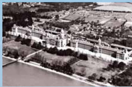
Royal Victoria Hospital, Netley

In the city of Southampton, a fragment of the medieval town wall is still standing. It is also the harbour from which the Pilgrim Fathers, religious dissenters from Nottinghamshire, set sail for the New World in the 16th C.