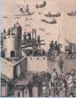
Sinking of the Mary Rose

The Mary Rose was built at about the time that Henry VIII came to the throne (1509) and was one of the first ships able to fire a broadside. She was a firm favourite of his and took part in most of his wars. She was raised in 1982, and is the only 16th C warship on display anywhere in the world.