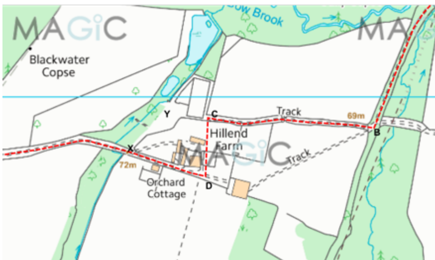
Figure 2. Extract of Ordnance Survey Map at scale of 1:10000 showing the application route between B and D in red through Hill End Farm. The alternative route through the farm shown on some early maps from C to Y to X is also shown.