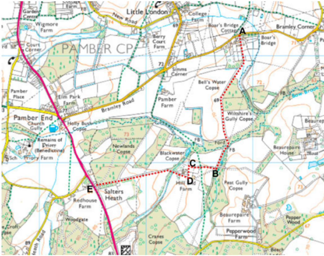
Figure 1. Extract of Ordnance Survey Map at scale of 1:25000 showing the application route between A and E in red.