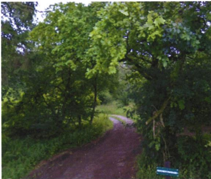
Figure 2. Start of application route at point A looking south.