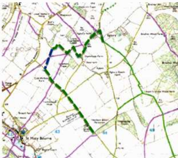
Figure 2. Extract Ordnance Survey Map at scale of 1:25000 showing the application route in blue and linked horse riding routes in green (bridleways) and dashed green byways and roads including application DMMO 1186.