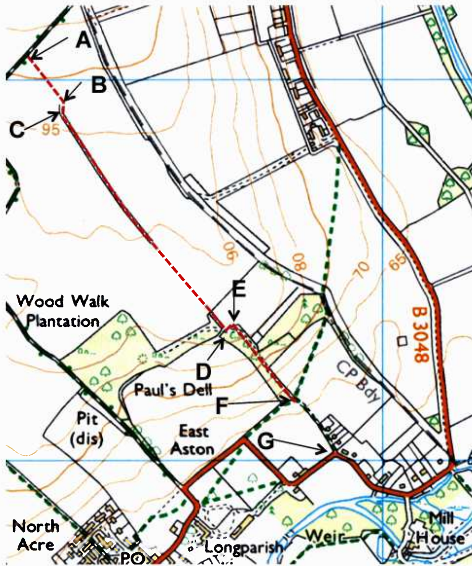
Figure 1. Extract from Ordnance Survey Map at scale of 1:25000 showing the application route from A to F in red and the footpath, Longparish 1, from F to G.