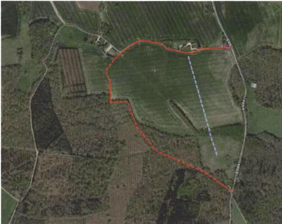
Figure 2. Aerial photograph showing application route 1 in red and application route 2 in blue.