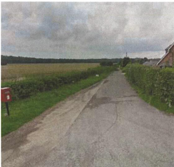
Figure 3. Start of application route 1 at point A looking west.